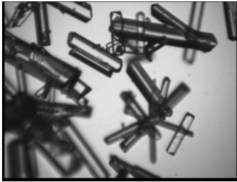
Ammonium oxalate crystals (Optical imaging)

The knowledge of the shape and size distributions of solid particle populations has been of increasing interest (both theoretical and practical) over the last decade. More particularly, crystals in liquid suspension are frequently used in industrial processes (e.g. for pharmaceutical technology) and is one of the LGF CNRS laboratory preoccupations. Their geometrical characterization is required for exploring the physico-chemical properties of crystallization processes. Using an in-situ camera, it is possible to get images of such crystal populations (as exposed in the following figure).