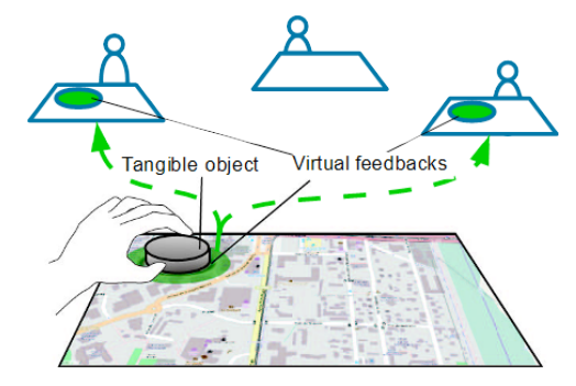
Figure 1. Users follow an emergency plan by interacting with tangible objects. The system analyses their actions in terms of their relevance to the plan and the quality of collaboration, and displays local or remote virtual feedback

Our goal is not to support the collaboration of people who are doing the same task in different geographical locations, nor to support the collaboration of people doing different tasks in the same location. Instead, we focus on supporting distributed collaboration where different organisations are jointly trying to achieve an overall task through an intricate coordination of their individual sub-tasks. This is achieved by allowing the actors to work