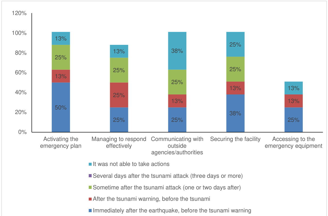
5 Fig.2 Timing of emergency actions