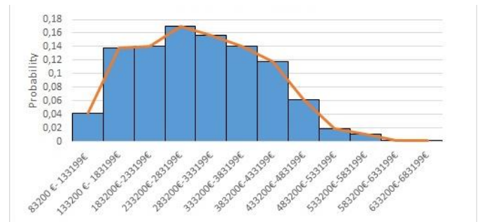
Fig. 3. Variability of the profits for battery provider

Next, the values of the uncertain factors obtained from the simulation sampling (average number of ongoing contracts per year, contract duration, lease amount and robot lifetime) and the values of the variable of interest generated by the simulator were plotted by using scatterplots. This visual inspection gives a first insight into the importance of each of parameter on the variability of the output of the model. It was proceeded to spot any patterns in the graphs that indicate the presence of high sensitivity.