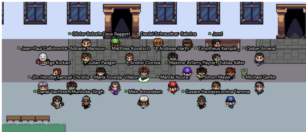
■ Figure 1 The traditional end-of-seminar photo on the stairs of Virtual Schloss Dagstuhl.

follow-up event was scheduled for July 9, 2021, and several participants offered to contribute to a shared “live” demonstrator space that would allow to integrate technologies and to try out new ideas across the targeted research areas (see also the working group report in Section 6.1).